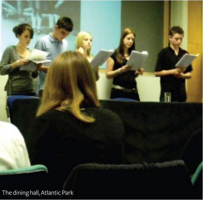
The dining hall, Atlantic Park