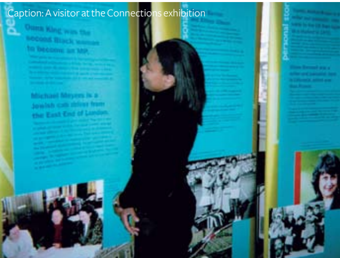
Caption: A visitor at the Connections exhibition

The Connections exhibition celebrates the connections, relationships and shared experiences of Asian, Black and Jewish immigrants to the UK, detailing their experiences of oppression and their fight against discrimination, as well as looking at the fusions between and appreciation of the others’ culture, music, comedy, language and food.