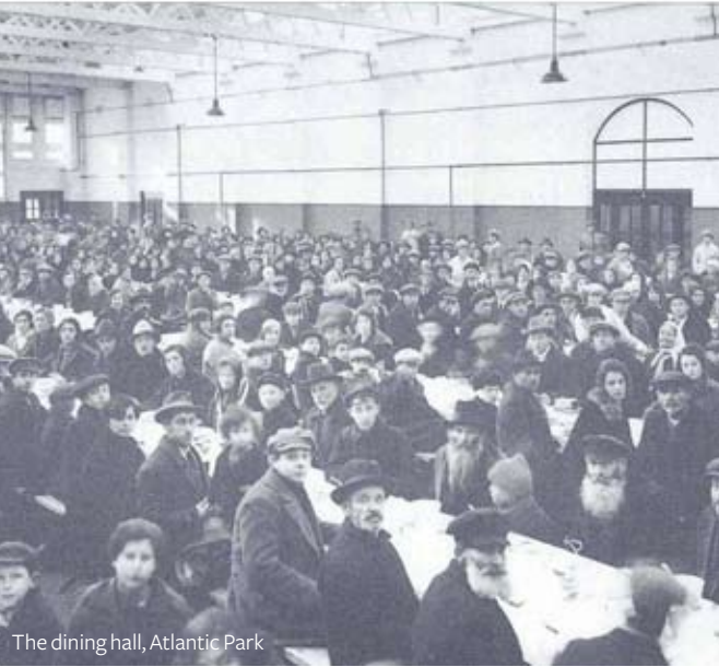
The dining hall, Atlantic Park

One particularly novel form of outreach work, which brought together this objective alongside undergraduate teaching, came