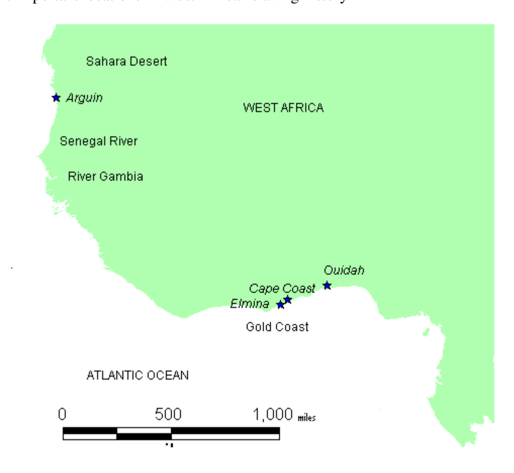
Figure 1. Important locations in West African slaving history