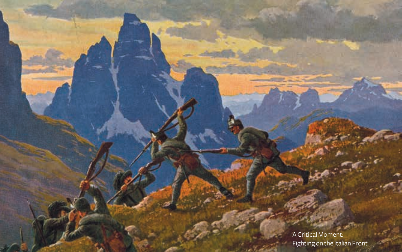
A Critical Moment: Fighting on the Italian Front