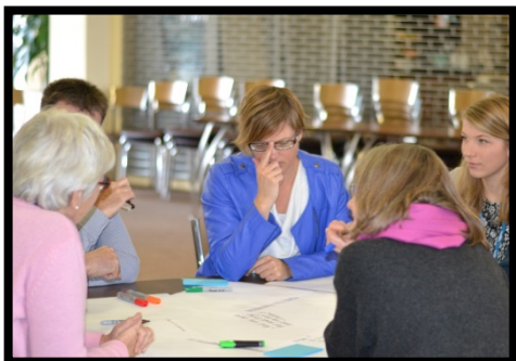
World café in action

"Really excellent, thought provoking. Enjoyed both the presenters and the questions and comments of the participants"