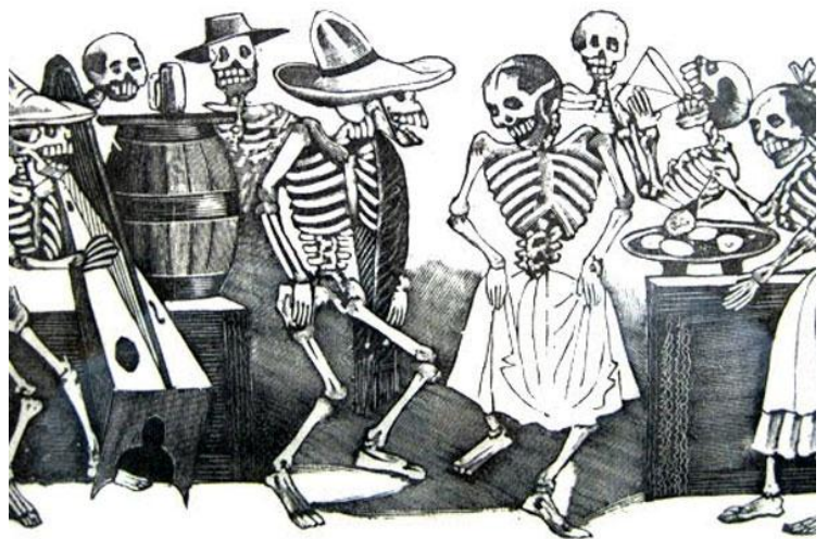
Jose Guadalupe Posada (1852-1913)

Location: Bridge Bar, Building 42, Highfield Campus