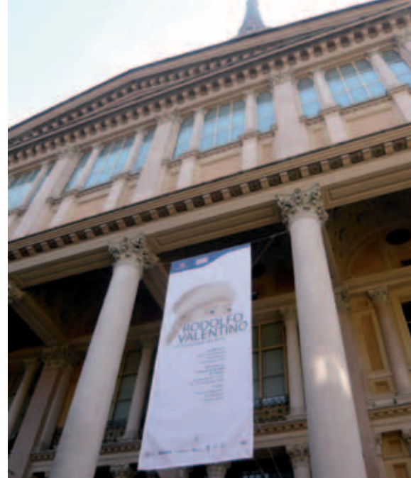
Museo Nazionale del Cinema