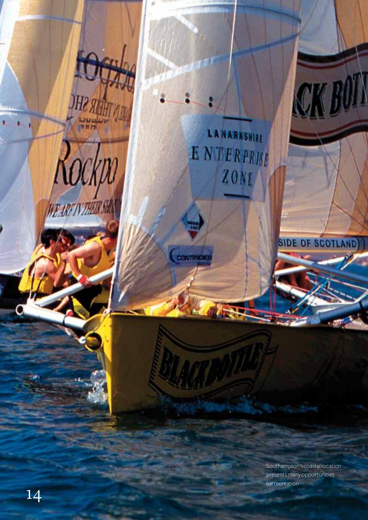
Southampton's coastal location presents many opportunities for recreation