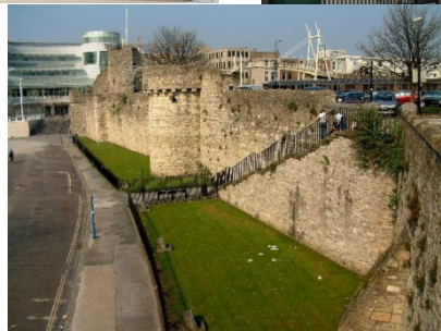
(Bargate, Tudor Houses and Medieval Walls in Southampton's Old Town)